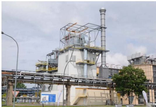
In the Schwarze Pumpe Power Plant, Germany, a LOESCHE Mill type LM 35.3 D is in operation

Many years of successful cooperation with Sinoma International Engineering ensured that the contract was again awarded to LOESCHE.